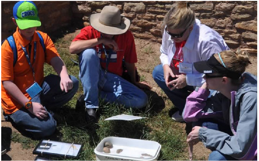
Students analyzing artifacts at the Preserve America Southwest Ancestral Landscapes Youth Summit, Mesa Verde Country, June 2014.